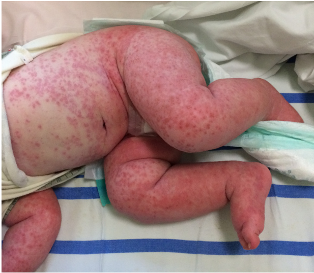
Fig. 1. Child with atypical hand, foot and mouth disease associated with coxsackievirus A6 infection, Wrocław, Poland, February 2016.

28 samples, 20 (71.4%) were positive for enteroviruses using RT-PCR, 10 stools (100%) and 10 swabs (55.5%).